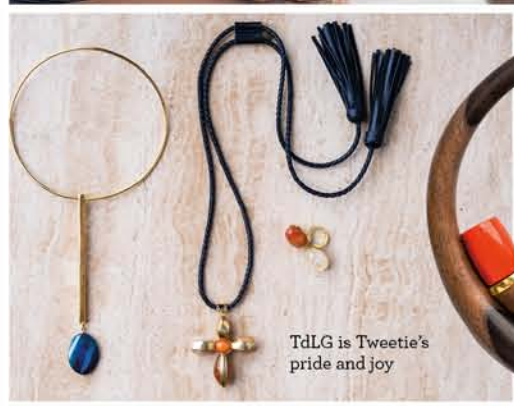
Her pieces are understated and sophisticated