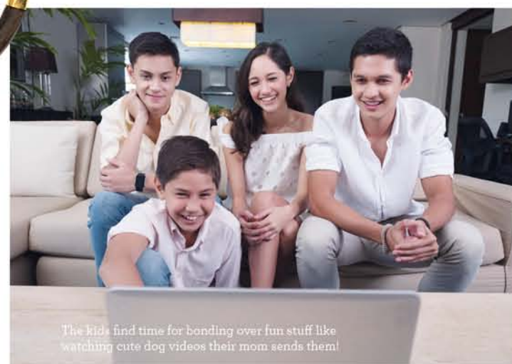
The kids find time for bonding over fun stuff like watching cute dog videos their mom sends them!